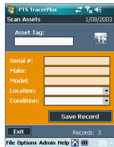
Scan Assets Screen (Windows Mobile shown)